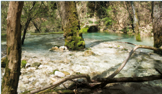
Vipava River (Slovenia).

Ticino Park is able to reproduce Lasca in captivity condition thanks to procedures developed under the Life project CON.FLU.PO. For this reason it helps FRIS in the organisation of a fish farm suitable for Lasca, giving young fish born in Parco's hatchery and providing breeders .