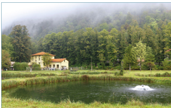
FRIS fish farm in Kobarid (Slovenia)

The Ticino Park helps FRIS by giving fish during the first years of the project and by providing his experiences. The FRIS takes care of the repopulation of the water courses of Vipava Valley.